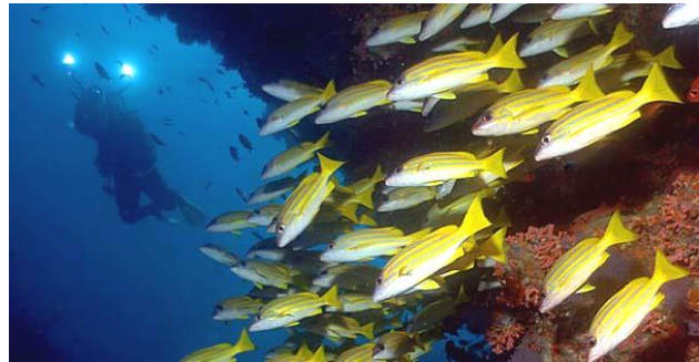
Cave at Banana Reef

Notes: Banana Reef is in the Maldivé Islands on the eastern side of the North Malé Atoll near Full Moon, Farukolh, and Kurumba Islands. This is one of the underwater coral caves explored by scuba divers.