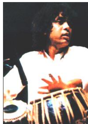
Zakir HUSSAIN

Notes: The liner notes explain – " The Dancing Sorcerer features Airtó on berimbau and Zakir on tabla and madal. The berimbau (musical bow) is one of the oldest instruments known to man. In fact, it may be the image of a musical bow in the caves at Les Trois Frères (15,000 B.C.) that provided the first documentation of percussion's connection to the sacred. This picture resembles a man wearing the skin of an animal and playing some kind of instrument, possibly a sounding bow or a concussion stick." Actually the "little sorcerer" engraving at the Grotte des Trois-Frères dates to the Upper Paleolithic (13,000 B.C.) and he is playing a nasal flute. (Dauvois 1994)