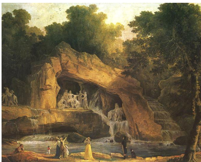
Grotte de Thétys – Painting by Hubert Robert