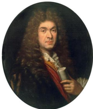
The painting of Lully by Nicolas Mignard.

In this case, the "Cave of Versailles" was a large stage in the garden at the north end of the chateau, which was destroyed in 1689 to make room for an addition on the north wing of the chateau. These statues were later moved to an artificial garden cave, the Grotte de Thétys or Grotte des Bains d'Apollon (Apollo's Cave), which is located not far west of the chateau itself. This garden cave was designed in 1774 by the painter Hubert Robert (1733-1808), who did several romantic landscapes showing caves and natural bridges. The arranger, Robert de Visée, who greatly admired Lully's music, was Louis XIV's court guitarist and later in 1719 he became "Maitre de guitare du roi" (the King's master guitarist) under Louis XV. This guitar entablature of Lully's overture presumably dates from 1685, when the "Grotto of Versailles" had the honor of a second performance at the royal court.