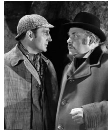
B. RATHBONE & N. BRUCE

Audio Editions 0-7435-5102-8 (6XCDs) (Disc 4 – Tks 7 to 13)